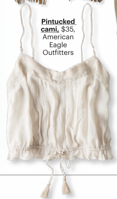
Pintucked cami, $35, American Eagle Outfitters