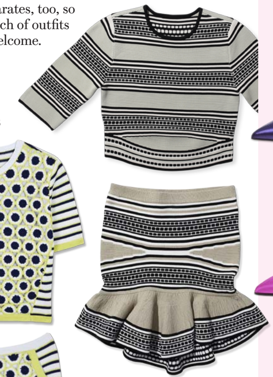
Lindsey top, $318, Alexia skirt, $328, both Ronny Kobo

The matchy-matchy trend will take you from brunch to date night.