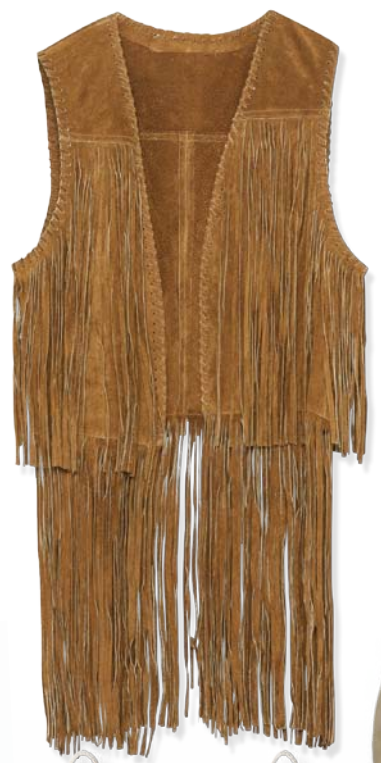
Leather waistcoat, $100, Zara

Yes! The new look is boho but still chic and modern—think ankle boots, distressed denim shorts, and textured white dresses, not over-the-top '70s style (or culturally insensitive headgear). Fringe strikes the hip/hippie balance, while an anorak keeps you warm when the sun sets over the main stage.