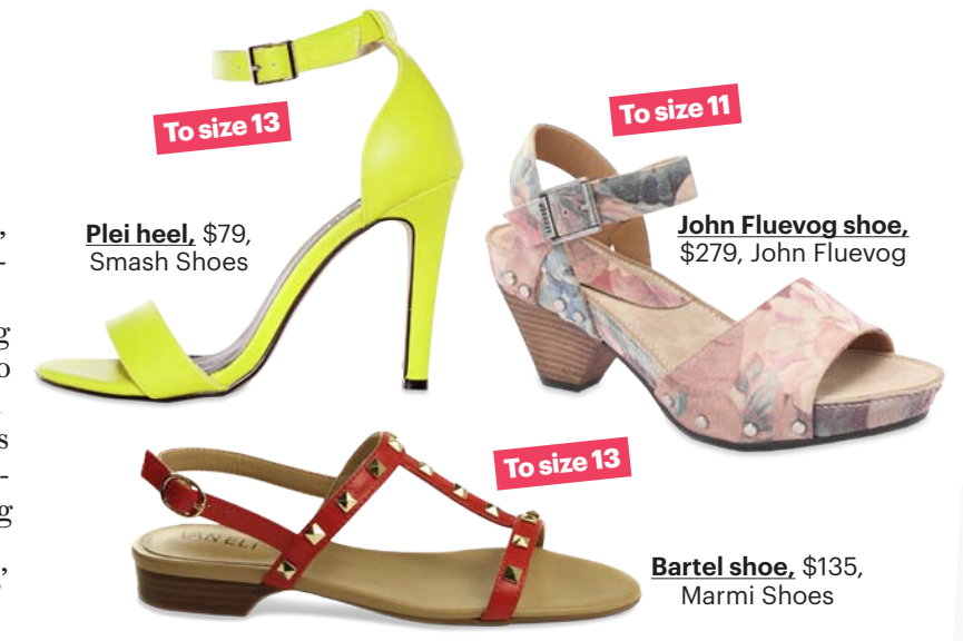
To size 13