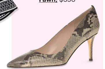
Fawn 70, $365