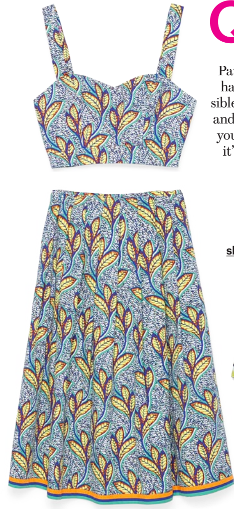
Printed top, $40, printed skirt, $50, both Zara

Patterned top-and-bottom sets are having a moment, with every possible permutation of sleeves, lengths, and styles. And the pieces work with your wardrobe as separates, too, so it's like getting a bunch of outfits in one. You're welcome.