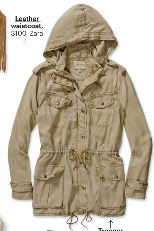
Trooper jacket, $120, Talula for Aritzia