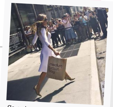
So cute you'll need a medium brown bag of your own!

The matchy-matchy trend will take you from brunch to date night.