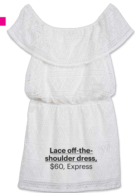
Lace off-the-shoulder dress, $60, Express