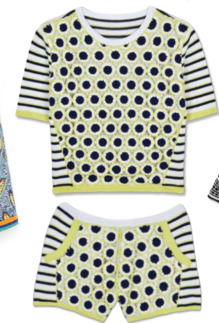
Co-ord knitted tee, $63, co-ord knitted short, $54, both ASOS