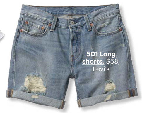
501 Long shorts, $58, Levi's

Q Cool festival style that doesn't involve floral crowns or feather headdresses: Does it exist?