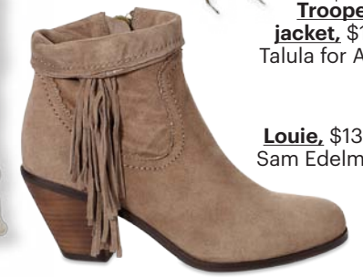
Louie, $130, Sam Edelman